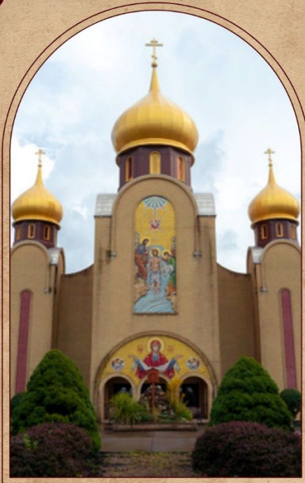
Cathedral of St. John the Baptist 1900 Carlton Rd, Parma, OH 44134

JOIN US AS WE CELEBRATE OUR FINAL HOLY DIVINE LITURGY