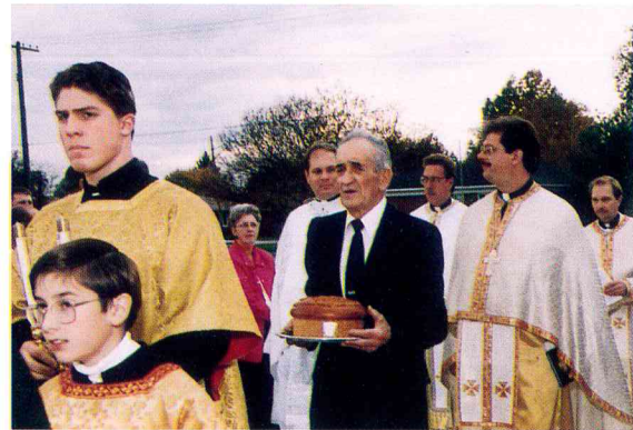
Procession to the Church