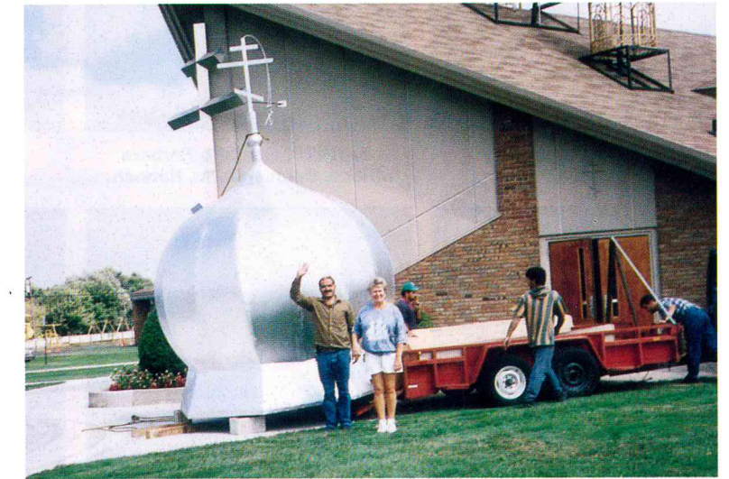
New Domes Arrive