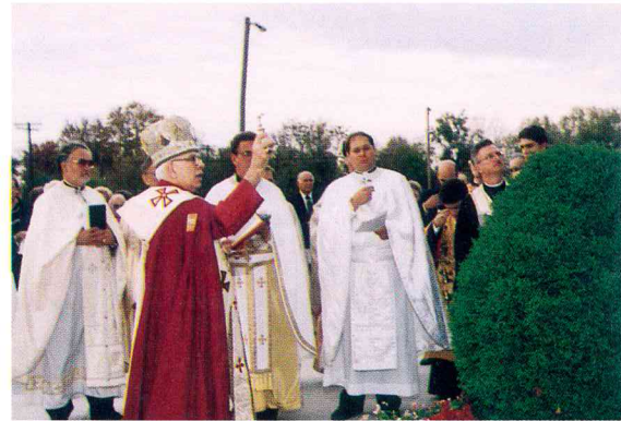
With Holy Water the Bishop blesses the outside of the Church