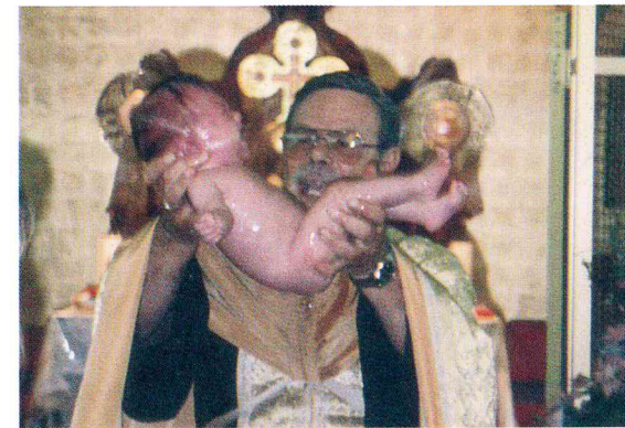
Our Newest Baptism