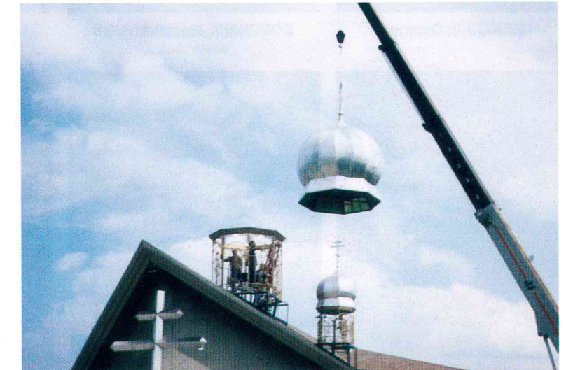
Setting New Domes in Place