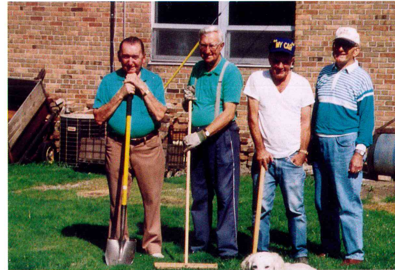
Members of the Parish Council "Hard at Work"