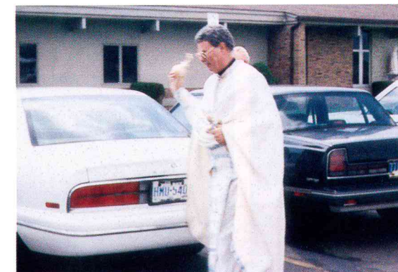
Blessing of the Cars "Feast of St. Elias"