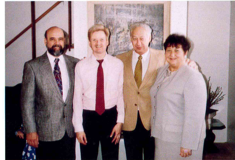
Finance Committee of the Parish