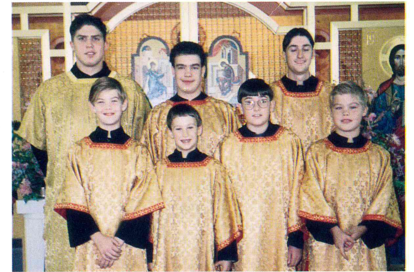
The Young Men of the Parish assisting at the Altar