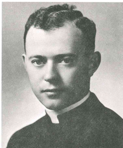
Our Jubilarian at the time of his ordination - 1945.