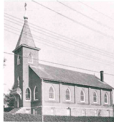
Old St. John's Church