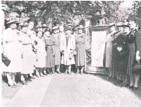
Dedication of Servicemen's Flag