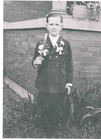
First Holy Communion