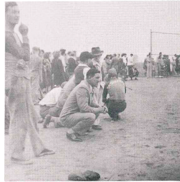
St. Stephen's Softball Team