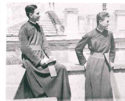
Lake Albano, Italy