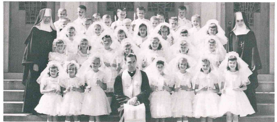
First Holy Communion Class — 1956