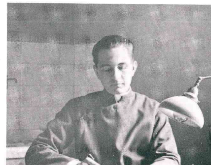
Student in Rome