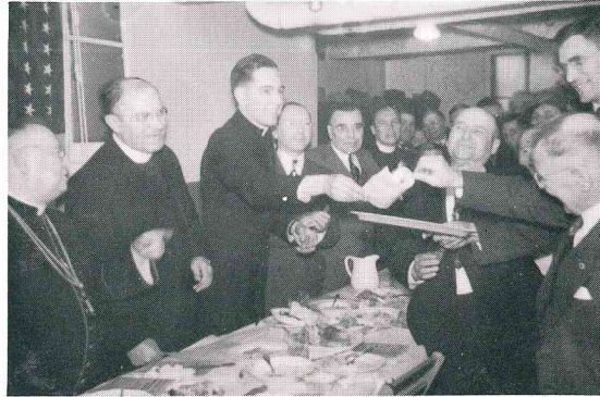
Burning of Mortgage