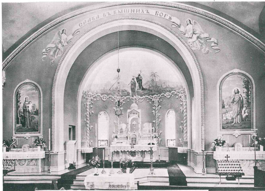
Home Parish — Minneapolis, Minnesota