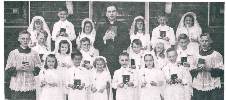
First Holy Communion Class — 1947