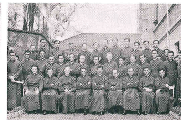
St. Josaphat's College