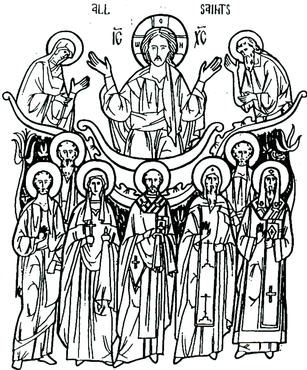
Sunday of All Saints