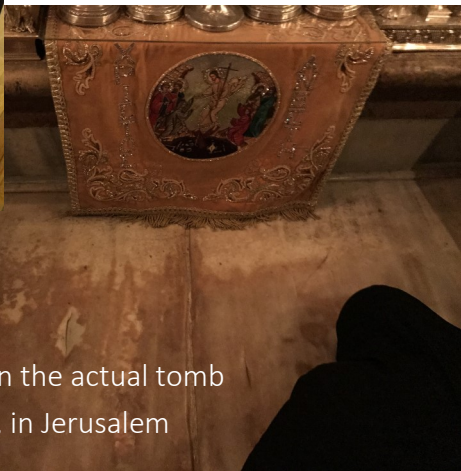
Praying in the actual tomb of Christ, in Jerusalem

This is the type of tomb you are probably accustomed to seeing at your church. It is meant to represent the stone upon which Jesus' body was placed in the tomb. The church itself (or your house, in this case) represents the outer walls of the tomb. You can make this type of tomb with a coffee table, a piano bench, or boxes. Cover it with a dark-colored blanket, table cloth, or other piece of fabric. On Friday evening you will place the body of Christ on top of the tomb.